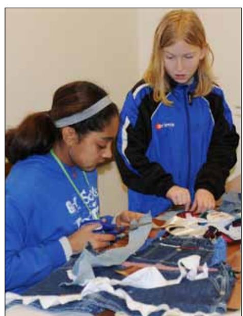
By JOYCE COSTELLO